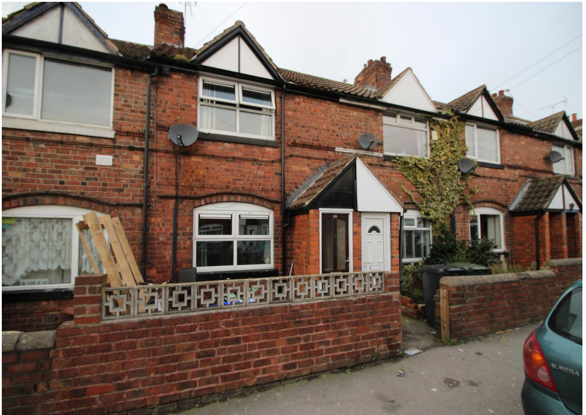
Scarsdale Street, Dinington, Sheffield Guide £60,000