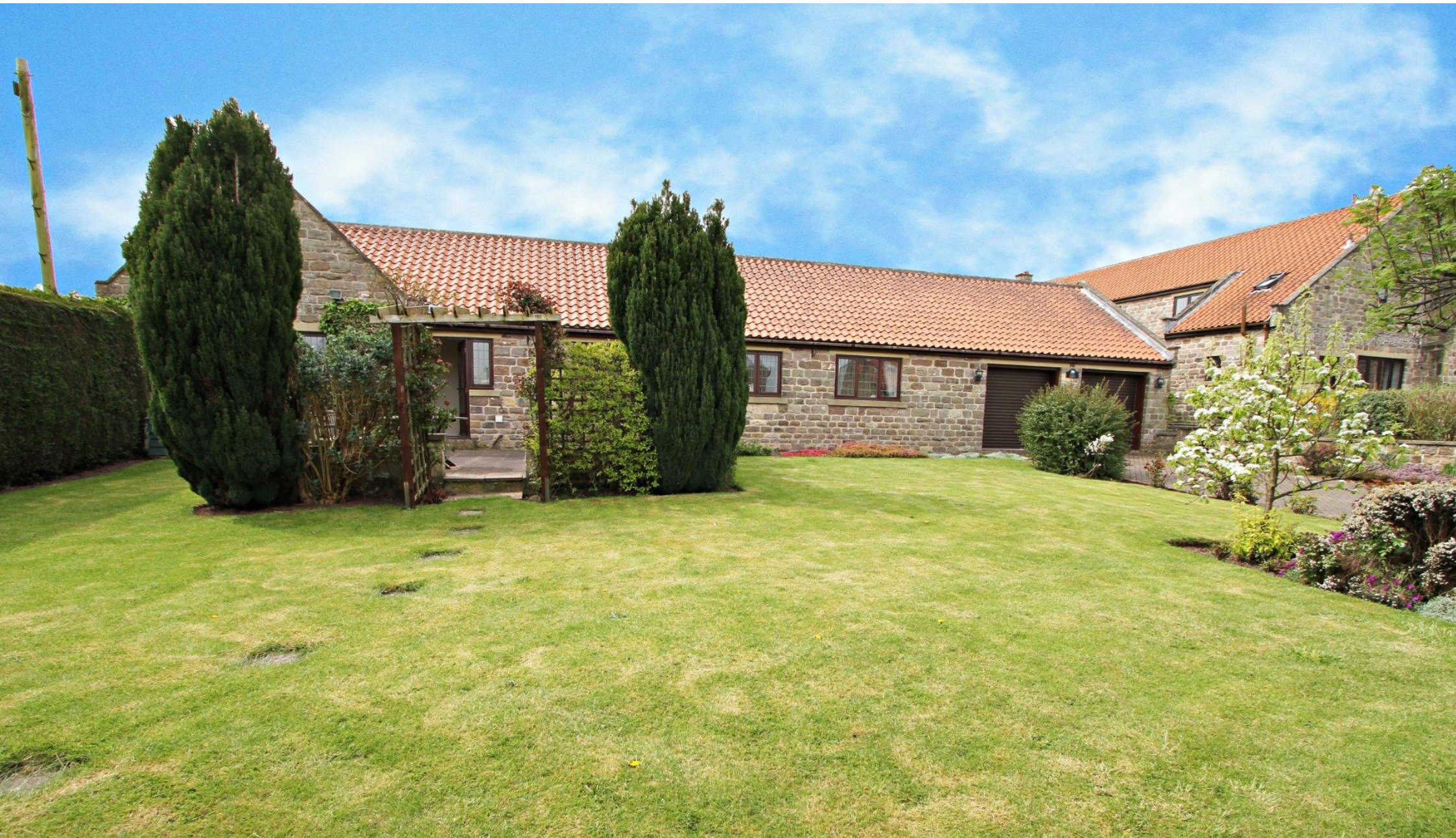
The lodge, Kiveton Lane, Todwick, Sheffield, South Yorkshire, S26 1HJ