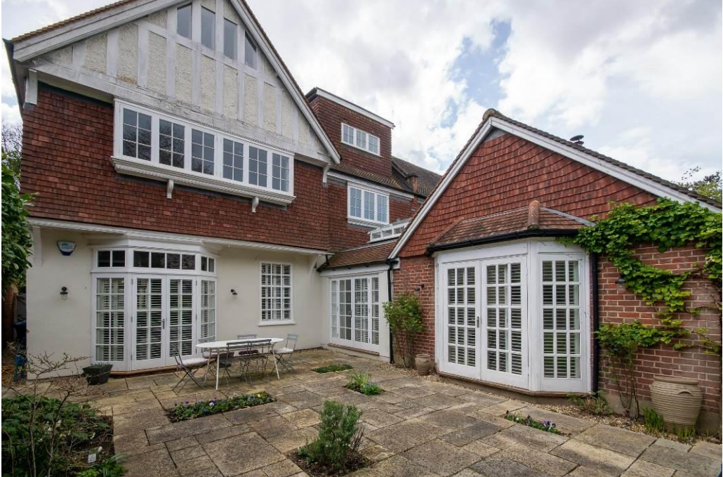
Andrew Pearce Property Consultants & Chartered Surveyors