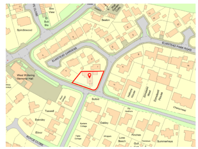
Brochure: March 2023 Reproduction only allowed with Authors consent

LOCAL AUTHORITY: Chichester Council 01243 785166