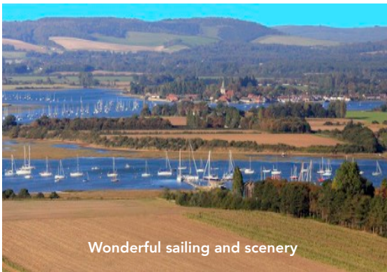
Wonderful sailing and scenery