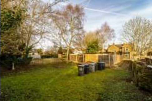
11 & 11A Glebe Road, Egham, Surrey TW20 8BU £525,000 - Freehold

Two separate properties on a significant plot offering a fantastic development opportunity (STPP) and with no onward chain. The first property sits and the front of the plot and comprises of two spacious reception rooms, kitchen, two double bedrooms and family bathroom. To the rear, there is a one bedroom house with living room, kitchen and downstairs bathroom. Further benefits include off-street parking, and substantial land to the rear of the plot. The properties are located within the town of Egham, which offers a variety of restaurants, bars, leisure facilities and is within easy access of the motorway network via the M25 & M3. Additionally, the property is within walking distance of both Thorpe Lea Primary School & Magna Carta Secondary School.