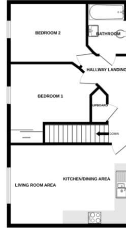
Measurements are approximate. Not to scale. Illustrative purposes only. Share with Mortgage 02020