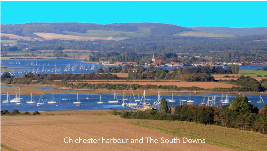
Chichester harbour and The South Downs

A superbly appointed 4 bedroom semi-detached Victorian Villa of immense character, with off street parking and a wonderful long south facing rear garden, in all set in about 0.1 acres, located within short walking distance to the city centre.