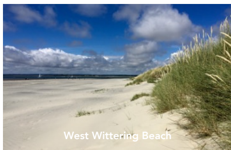
West Wittering Beach