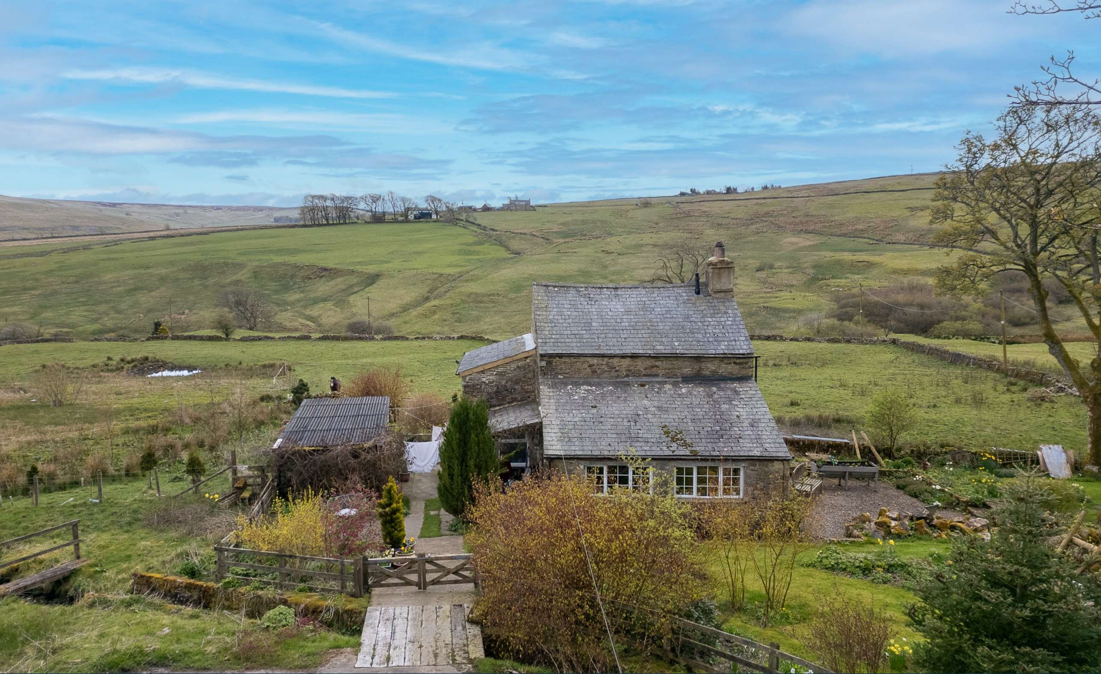
High Swinhope Mill Cottage Sparty Lea, Hexham, NE47 9UP