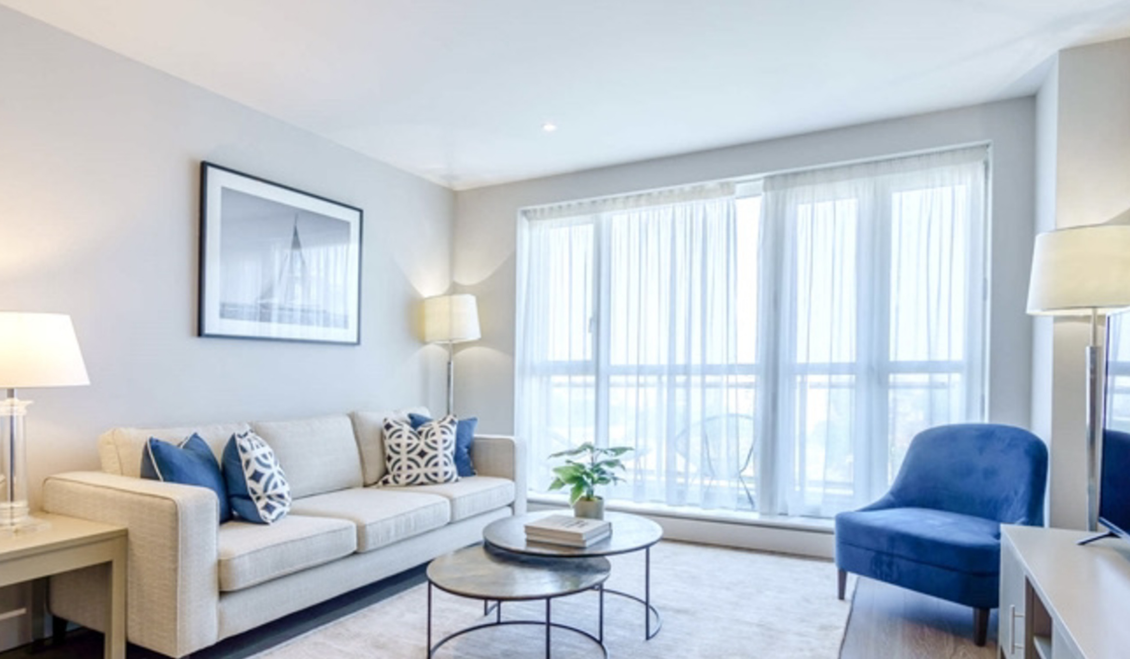
2 Bedroom 2 bath Flat, Canary Wharf, London E14