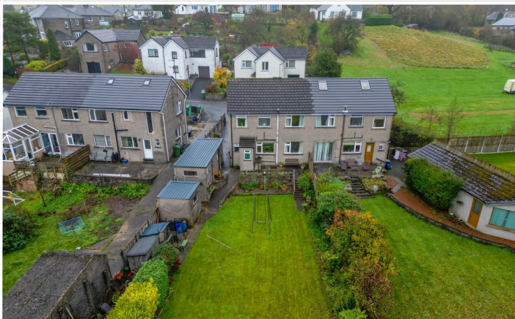
Elevated rear garden