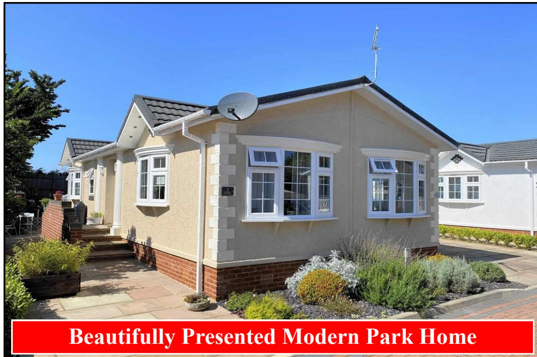
Beautifully Presented Modern Park Home

1 Knoll View, Winfrith Newburgh, Dorset. DT2 8GL