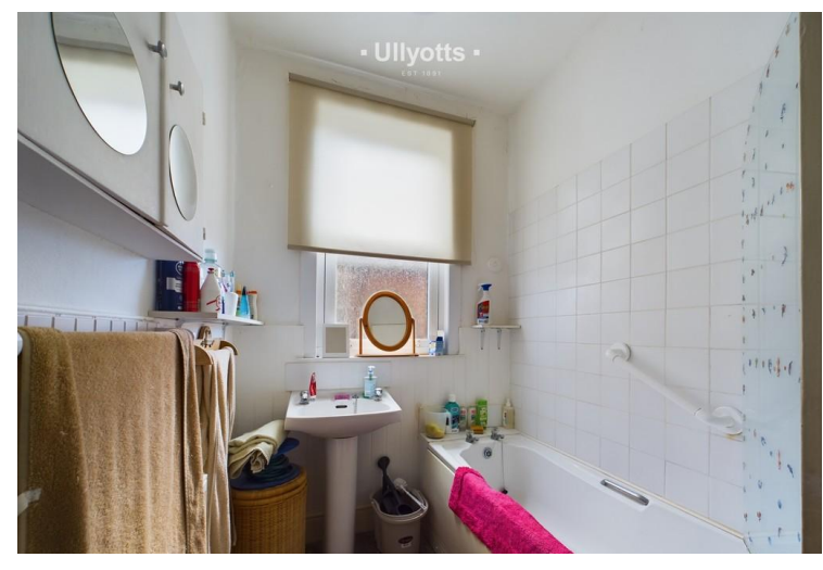
Flat 2 Bathroom