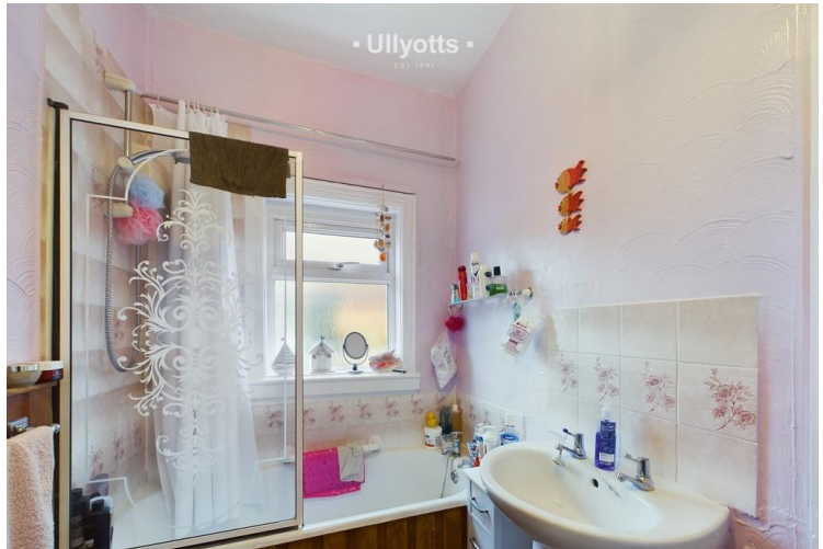
Flat 1 Bathroom