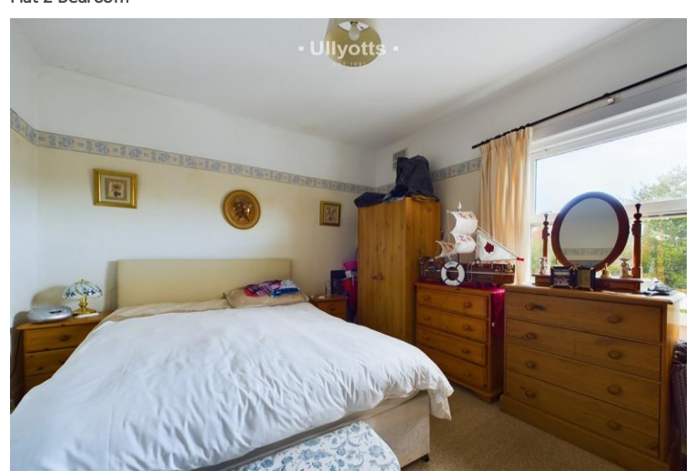
Flat 2 Bedroom