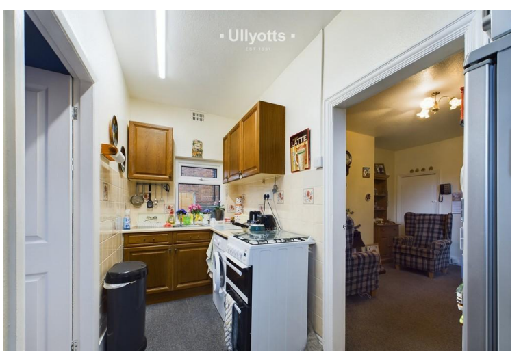
Flat 1 Kitchen

Flats 2 & 3 both benfit from gas central heating.