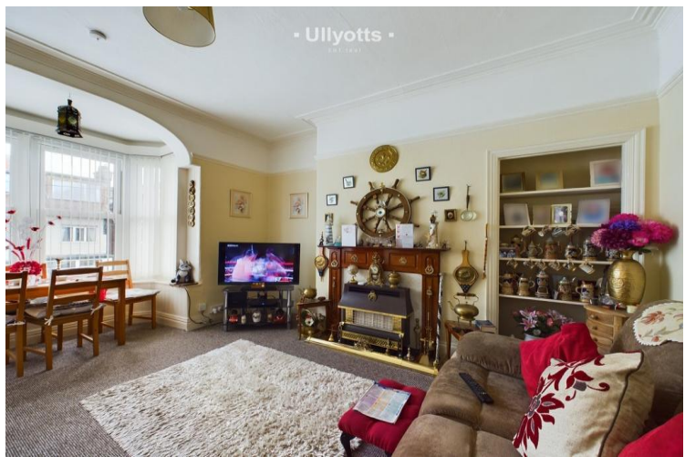
Flat 2 Lounge