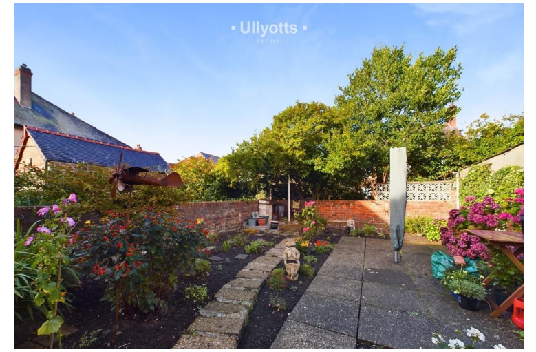
Flat 3 Bathroom Garden