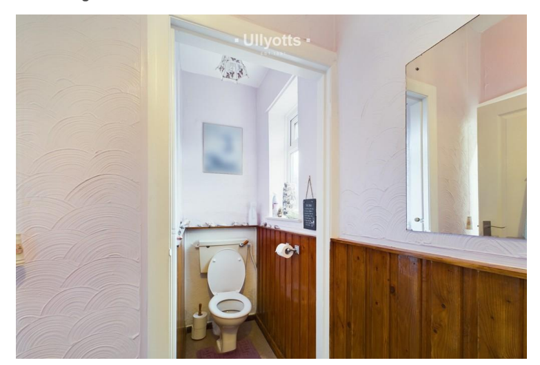
flat 1 wc