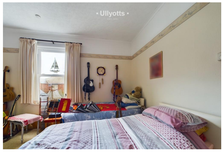
Flat 2 Bedroom