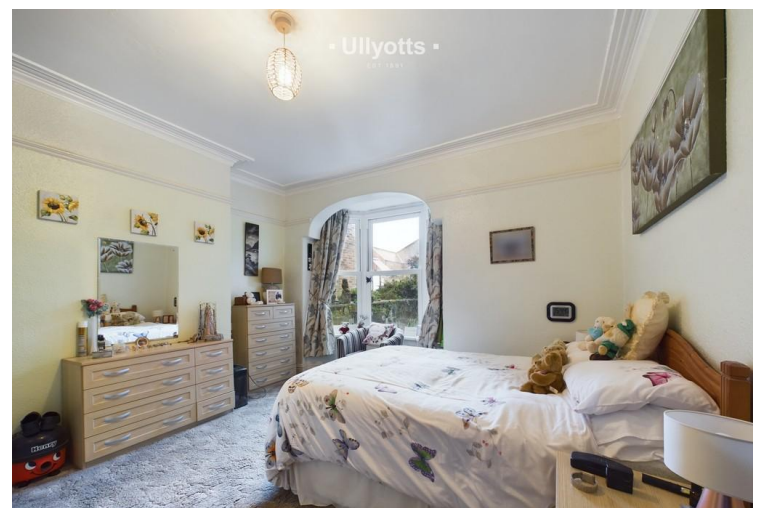
Flat 1 Bedroom