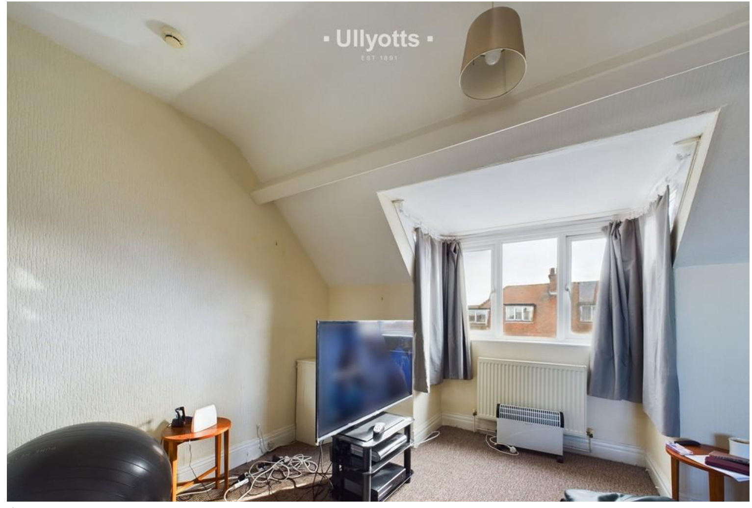
Flat 3 Lounge