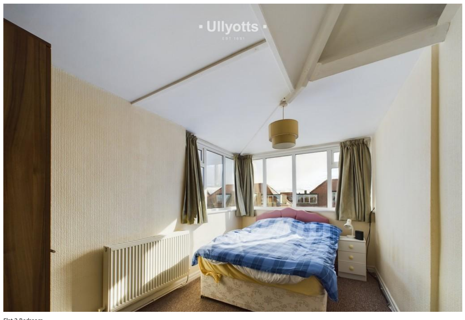
Flat 3 Bedroom