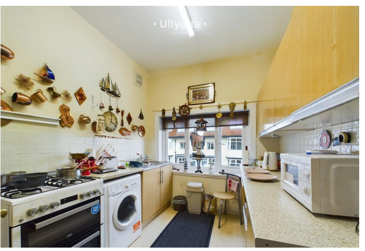
Flat 2 Kitchen

All mains services are available at the property.