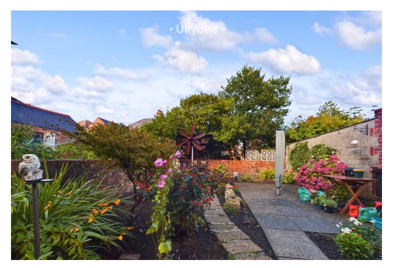
Flat 1 Garden