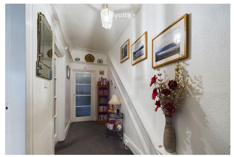
Flat 1 Entrance