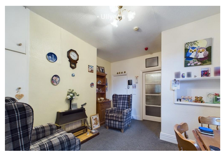
Flat 1 Sitting room