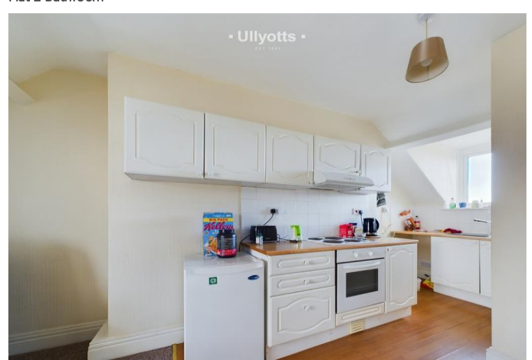
Flat 3 Kitchen