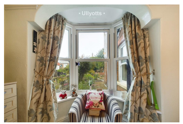
Flat 1 Bedroom