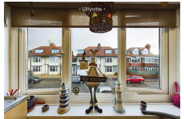
Flat 2 view