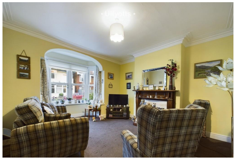
Flat 1 Lounge

With a window to the side and rear elevation, uPVC door to the rear garden. A range of wall and base units with worktop over, partially tiled walls, stainless steels sink and drainer, space for under counter fridge freezer and washing machine and door to: