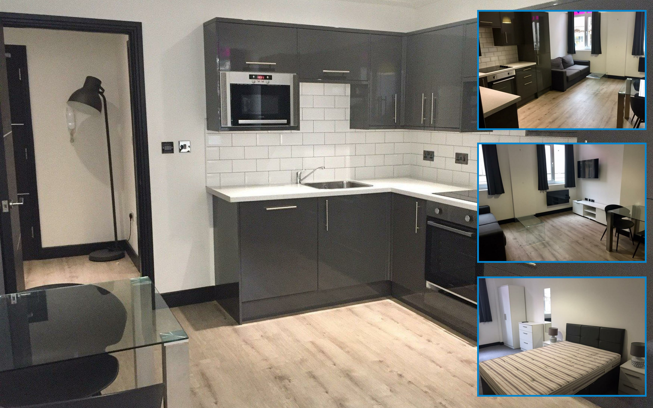
Apartment 10, 17 North John Street, Liverpool , L2 5AA £850