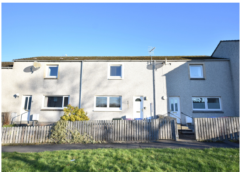
Fixed Price £140,000

2 Bedroom Mid-Terraced House located in the popular village of Fochabers. The property is conveniently positioned for all of the local amenities that the village has to offer.