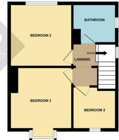
TOTAL FLOOR AREA : 88.8 sq.m. (956 sq.ft.) approx.

Whilst every attempt has been made to ensure the accuracy of the floorplan contained here, measurements of doors, windows, rooms and any other items are approximate and no responsibility is taken for any error, omission or mis-statement. This plan is for illustrative purposes only and should be used as such by any prospective purchaser. The services, systems and appliances shown have not been tested and no guarantee as to their operability or efficiency can be given. Made with Metropix ©2024