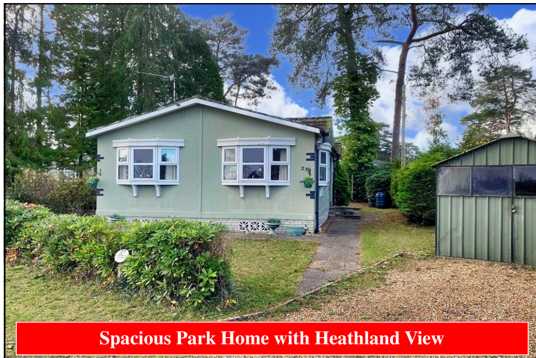
Spacious Park Home with Heathland View

23 Worley Way, Lone Pine Park, Lone Pine Drive, Ferndown. BH22 8NL