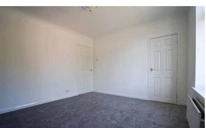
6 Woodside (E)