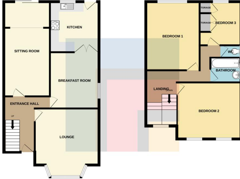
TOTAL FLOOR AREA: 1247 sq.ft. (115.8 sq.m.) approx.

Whilst every attempt has been made to ensure the accuracy of the floorplan contained here, measurements of blocks, windows, rooms and any other items are approximate and no responsibility is taken for any error, omission or mis-statement. This plan is for illustrative purposes only and should be used as such by any prospective purchaser. The services, systems and appliances shown have not been tested and no guarantee as to their operability or efficiency can be given. Made with Netopex iCAD25