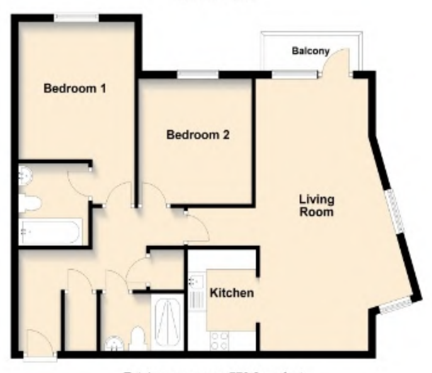
Total area: approx. 770.2 sq. feet

Please note that this floorplan is not to easie and is for Bustrative purposes only Plan produced using PlanUp.