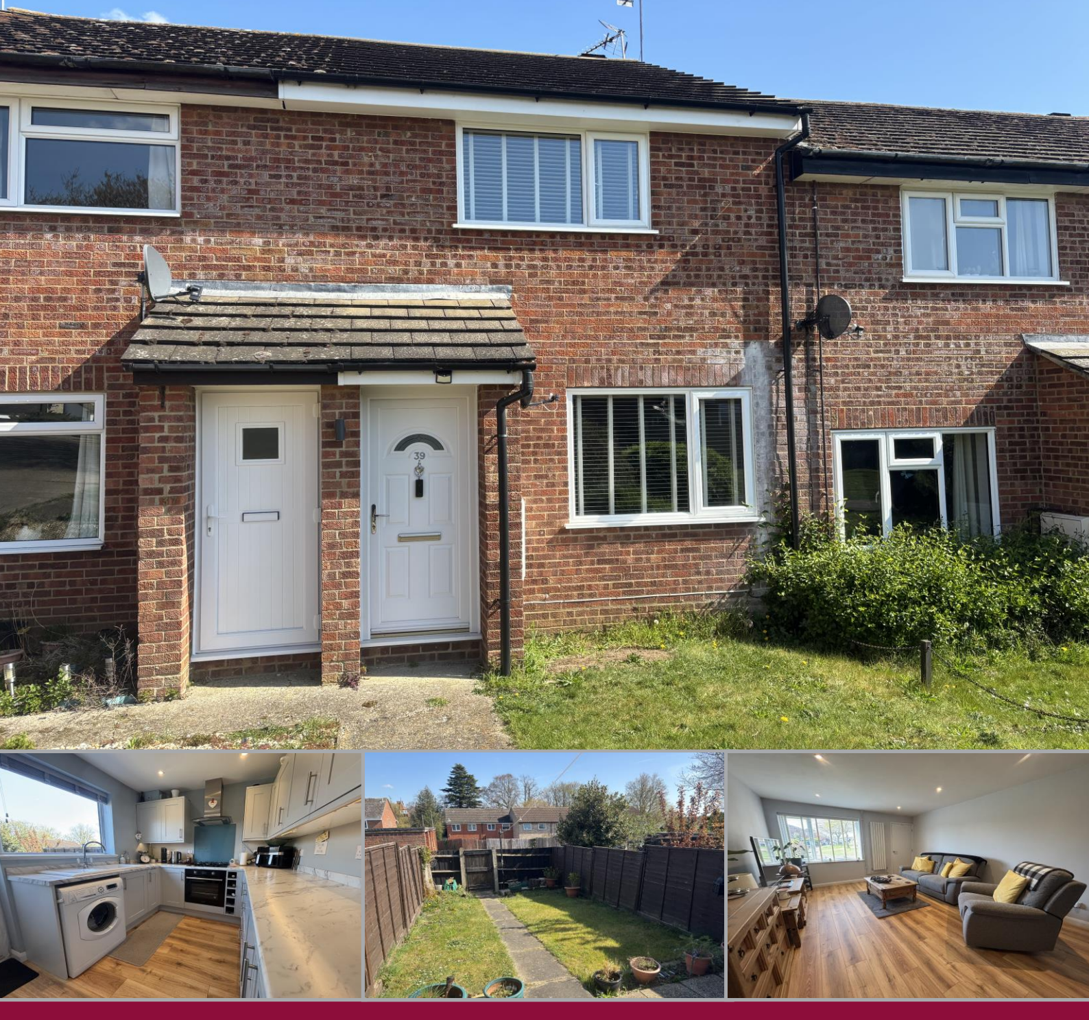
39 Ludbrook Close | Needham Market | Suffolk | IP6 8EE

Specialist marketing for | Barns | Cottages | Period Properties | Executive Homes | Town Houses | Village Homes