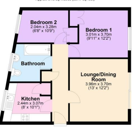
Total area: approx. 51.8 sq. metres (557.7 sq. feet)