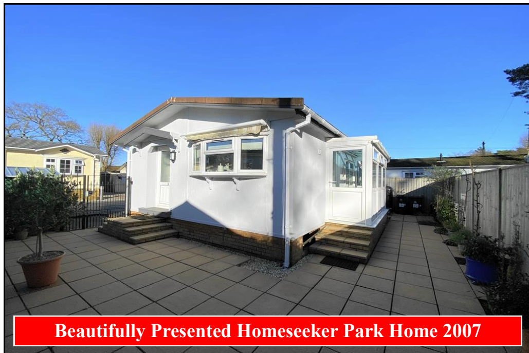
Beautifully Presented Homeseeker Park Home 2007

119a Pinehurst Park, West Moors, Ferndown, Dorset. BH22 0BS