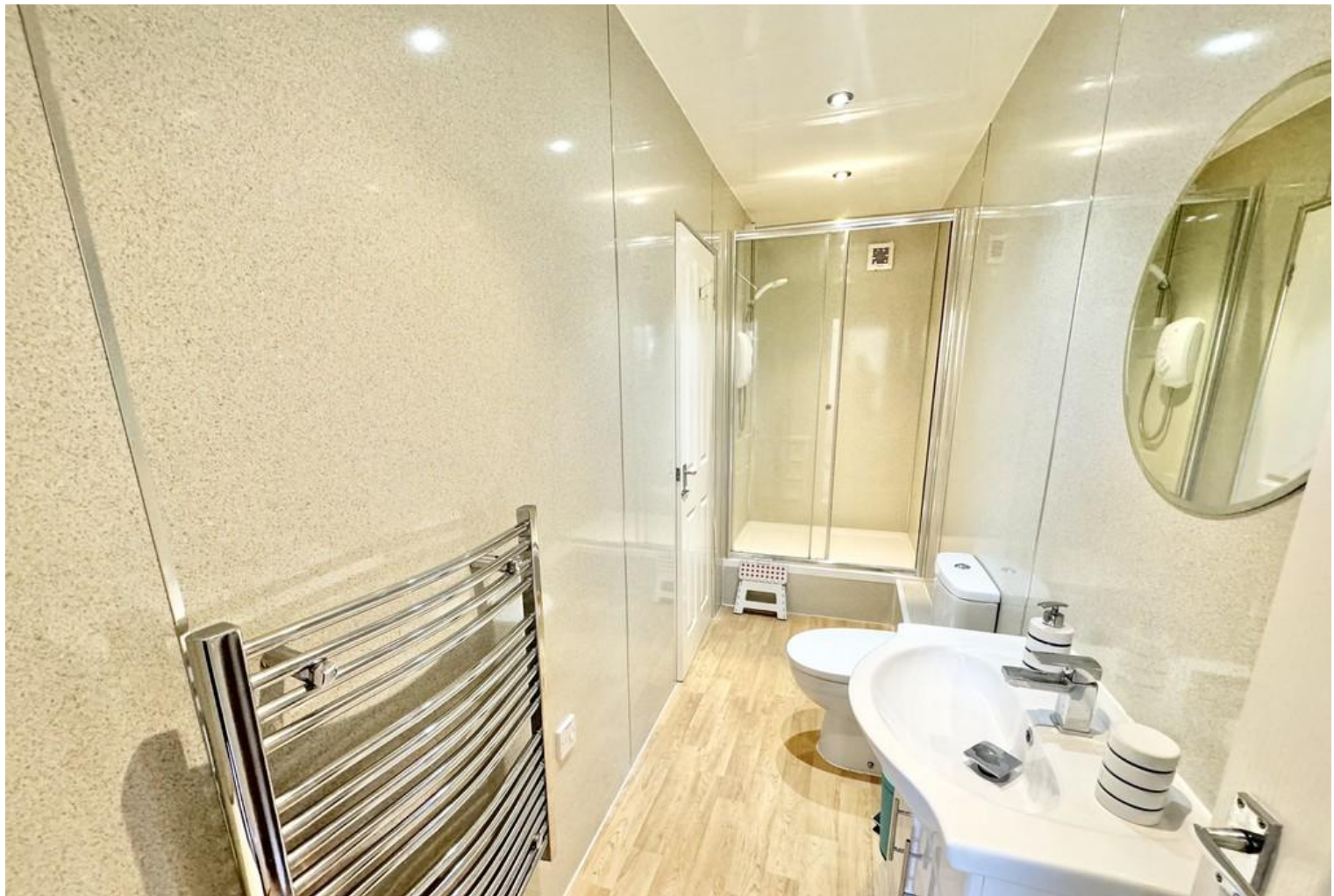
4 Shower room