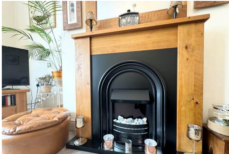
1 & 2 Feature Fireplace