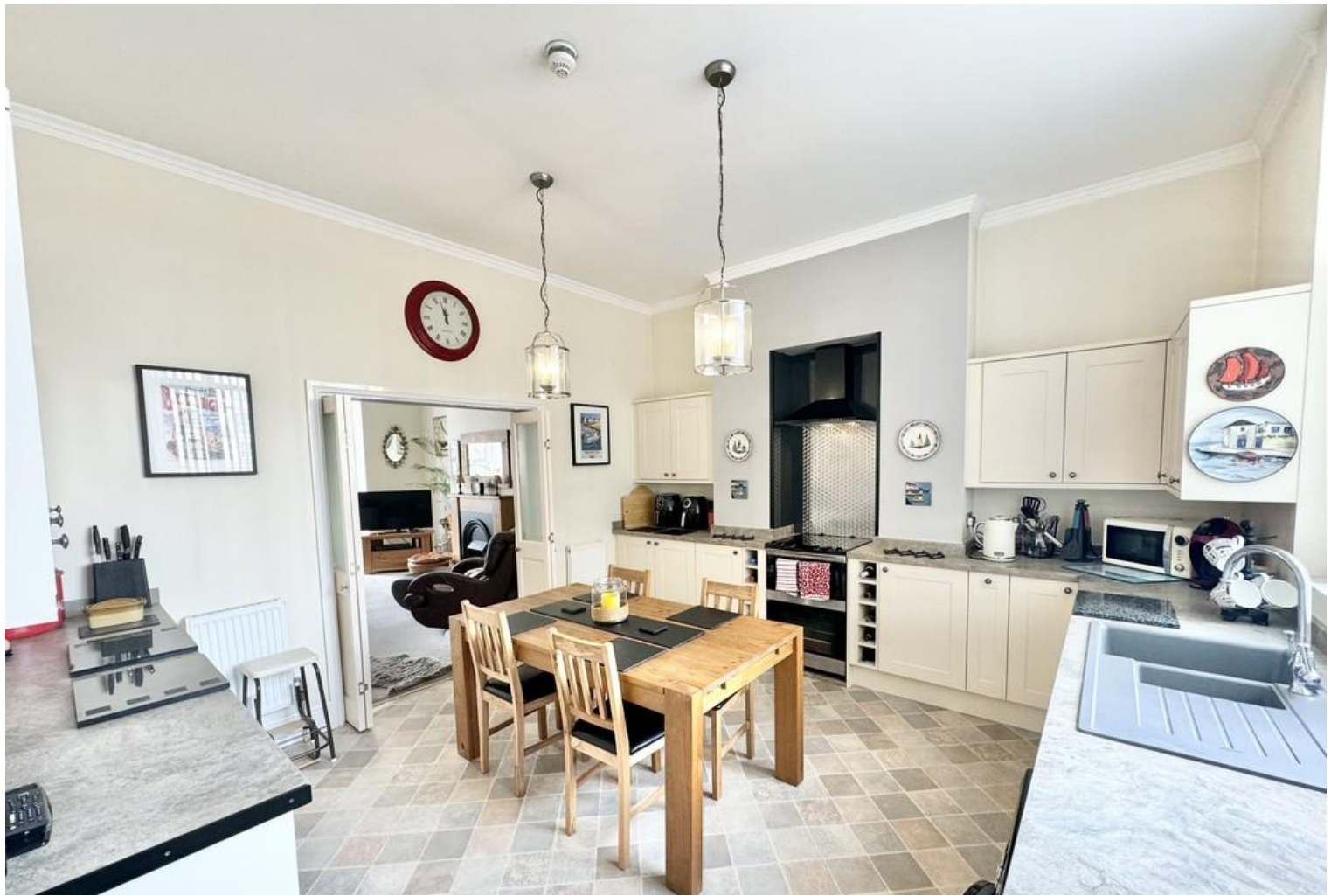
1 & 2 Kitchen Diner