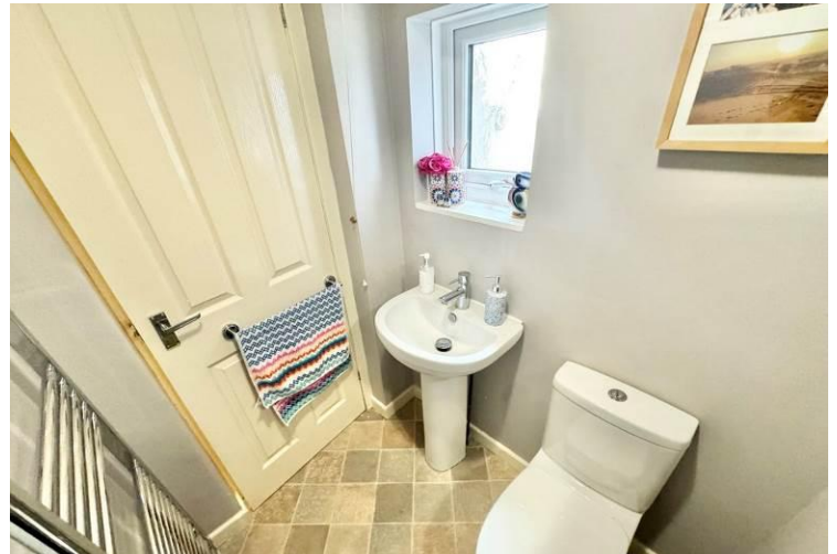
1 & 2 wc