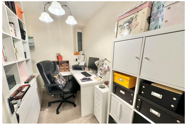
1 & 2 Office