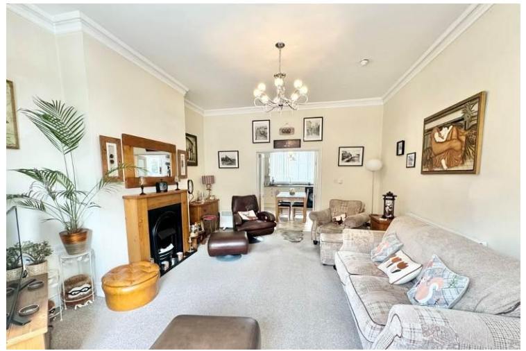
1 & 2 Lounge