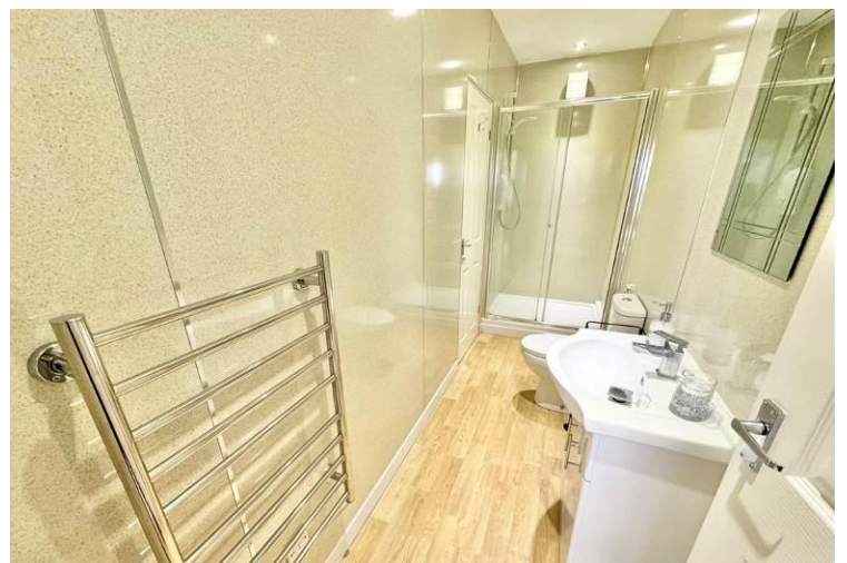
5 Shower room