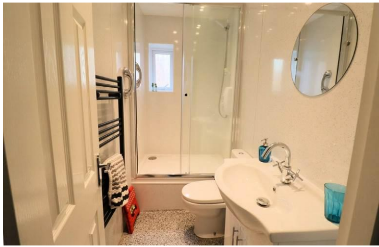
3 Shower room