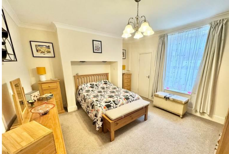
1 & 2 Bedroom 2