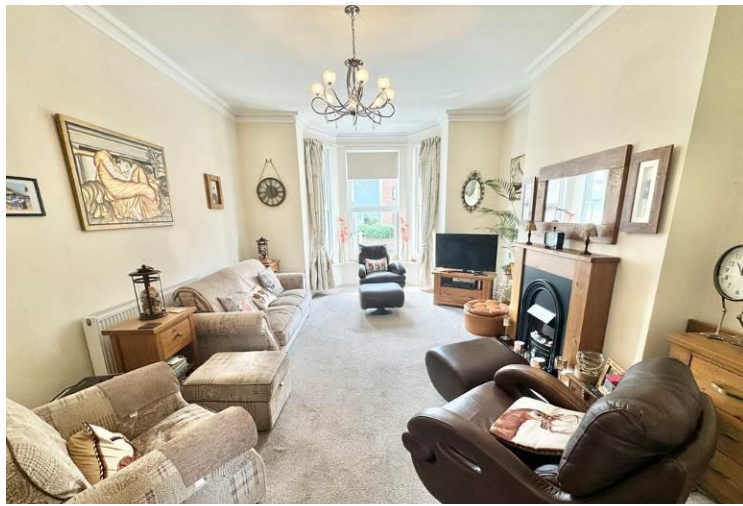
1 & 2 Lounge