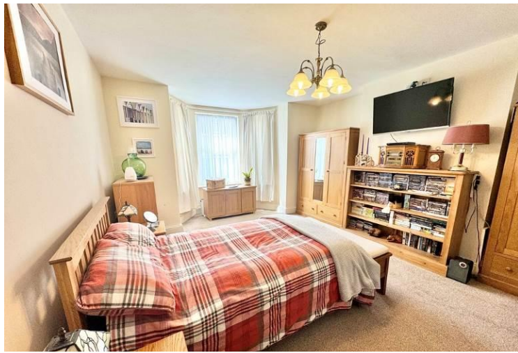
1 & 2 Bedroom 1