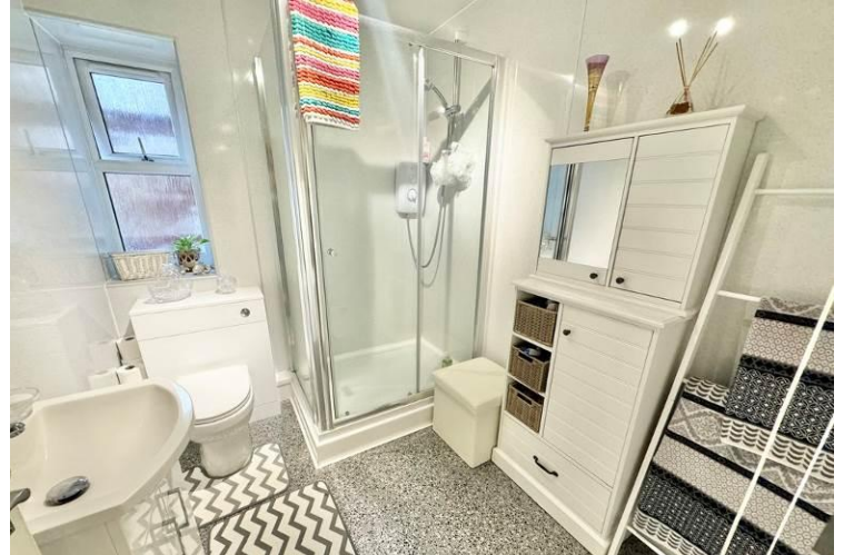
1 & 2 Shower room