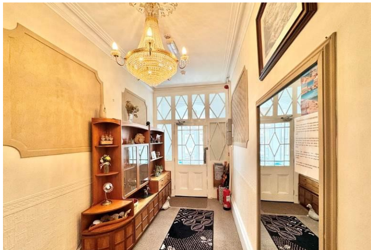
1 & 2 Entrance Hall