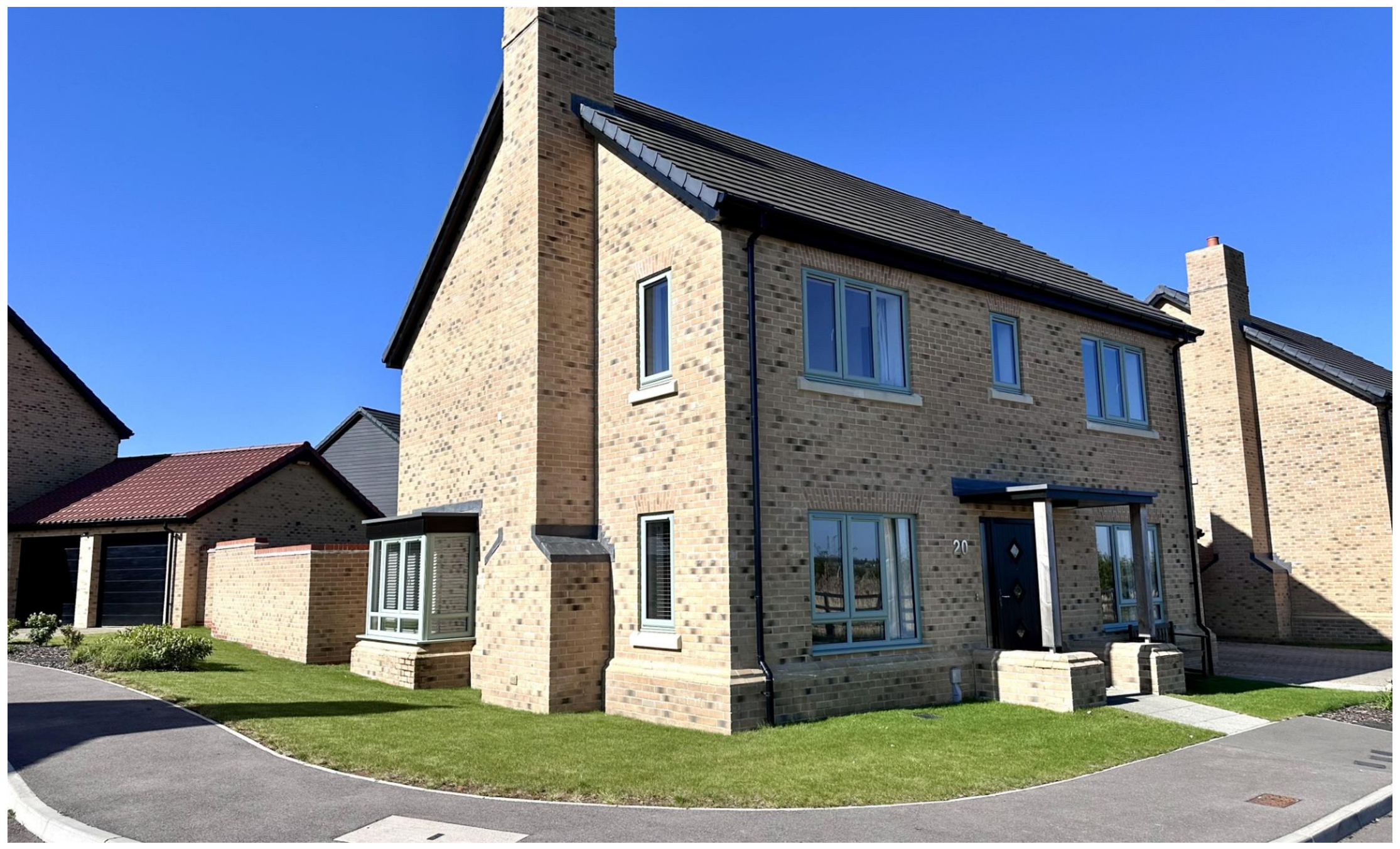
Ovins Rise, Haddenham, Ely, Cambridgeshire CB6 3LH