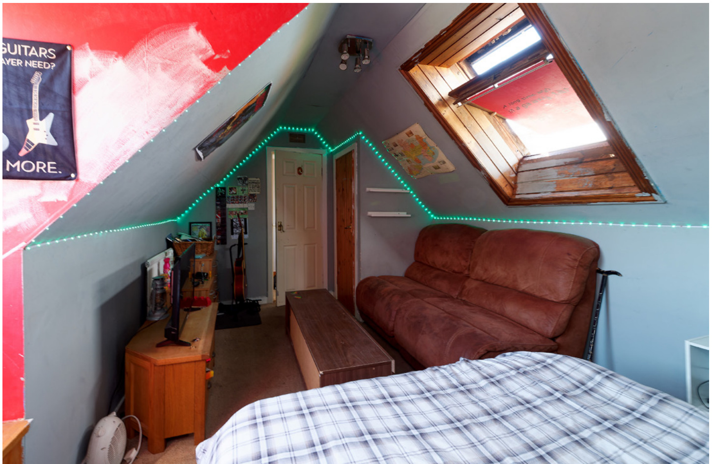
The upper level has a useful storage cupboard and two well-proportioned bedrooms. The high specifications of this family home also benefit from double glazing and gas central heating throughout.