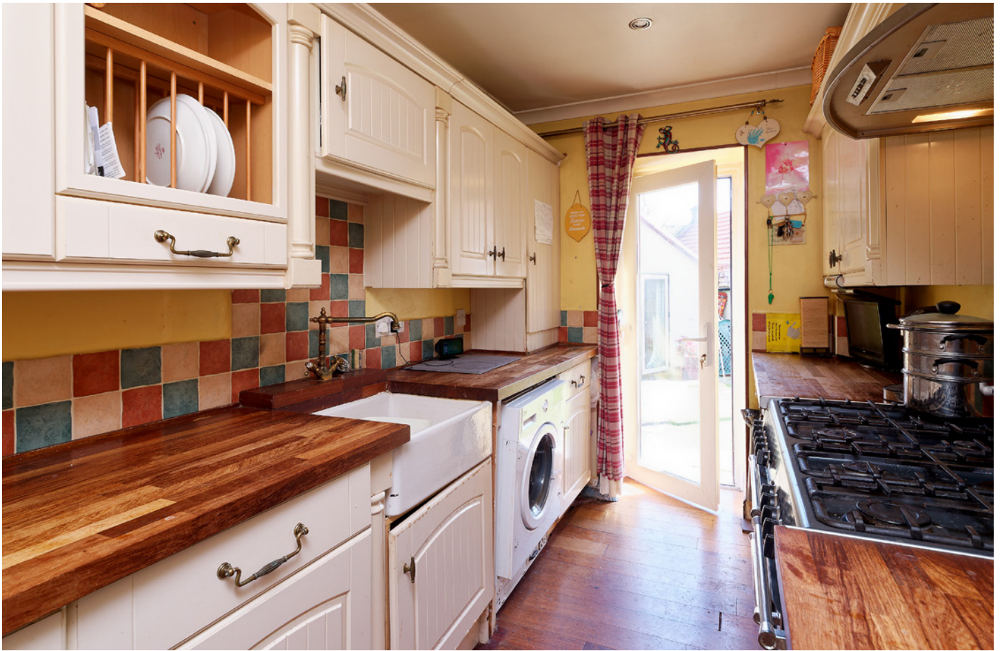
Access is gained from here into the kitchen, which has been fitted to include a good range of floor and wall-mounted units with a striking worktop, providing a fashionable and efficient workspace.