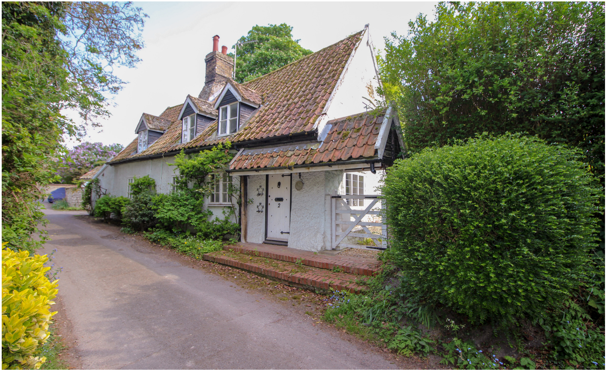
Gardeners Cottage, Burwell