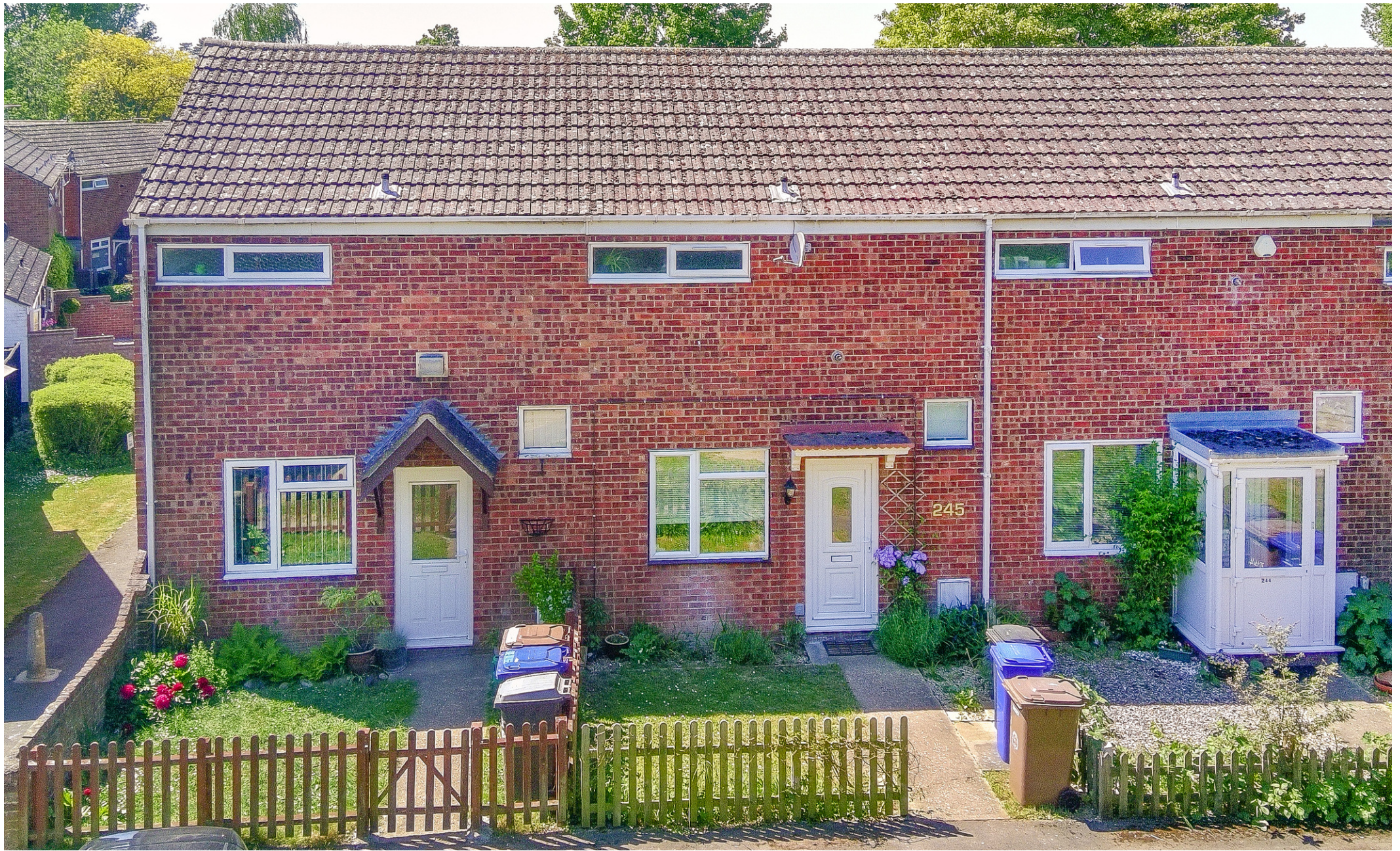
Parkers Walk, Newmarket, Suffolk