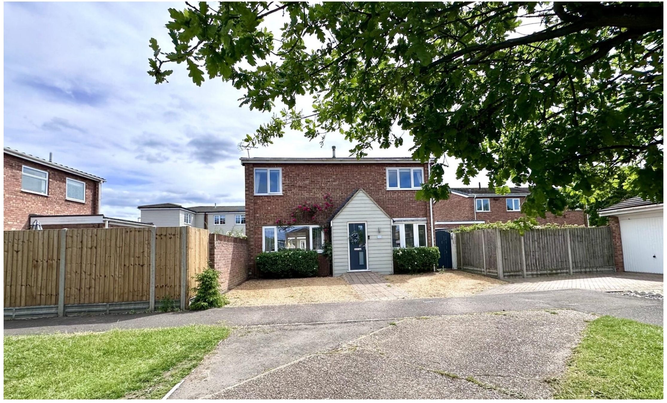
Herons Close, Ely, Cambridgeshire CB6 3EF