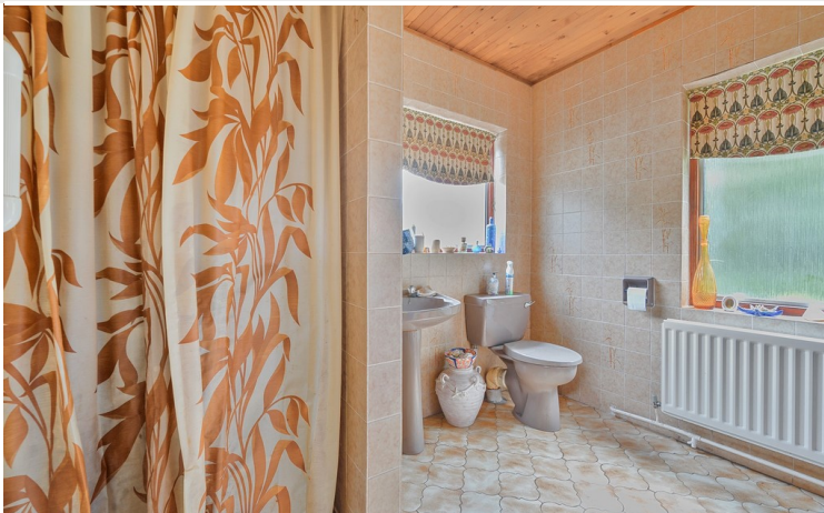
Downstairs Shower Room

Property Overview: The vibrant market town of Kendal offers seven primary schools, along with two highly regarded secondary schools: Kirkbie Kendal School and The Queen Katherine School. The town is also home to the high-achieving Kendal College.