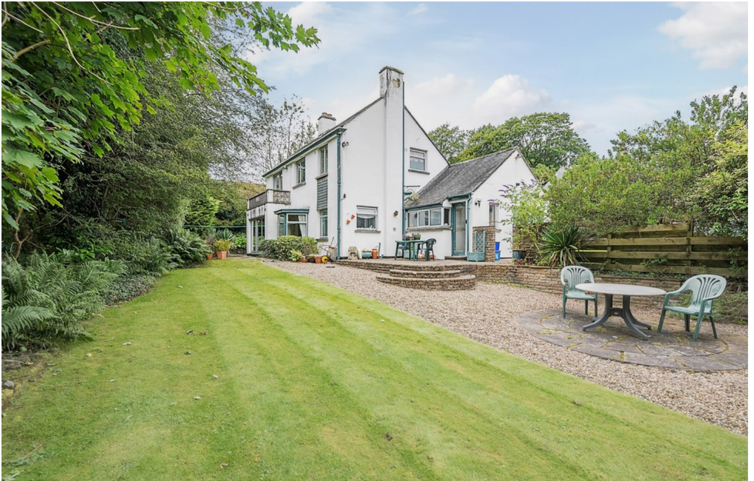
Rear Aspect and Garden