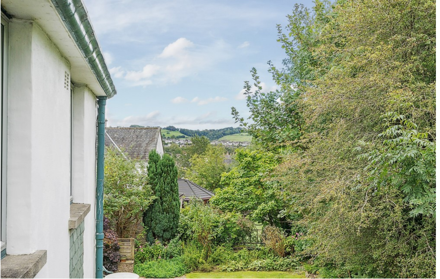
Views from the Balcony