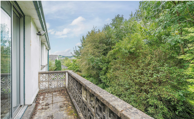
Bedroom One Balcony