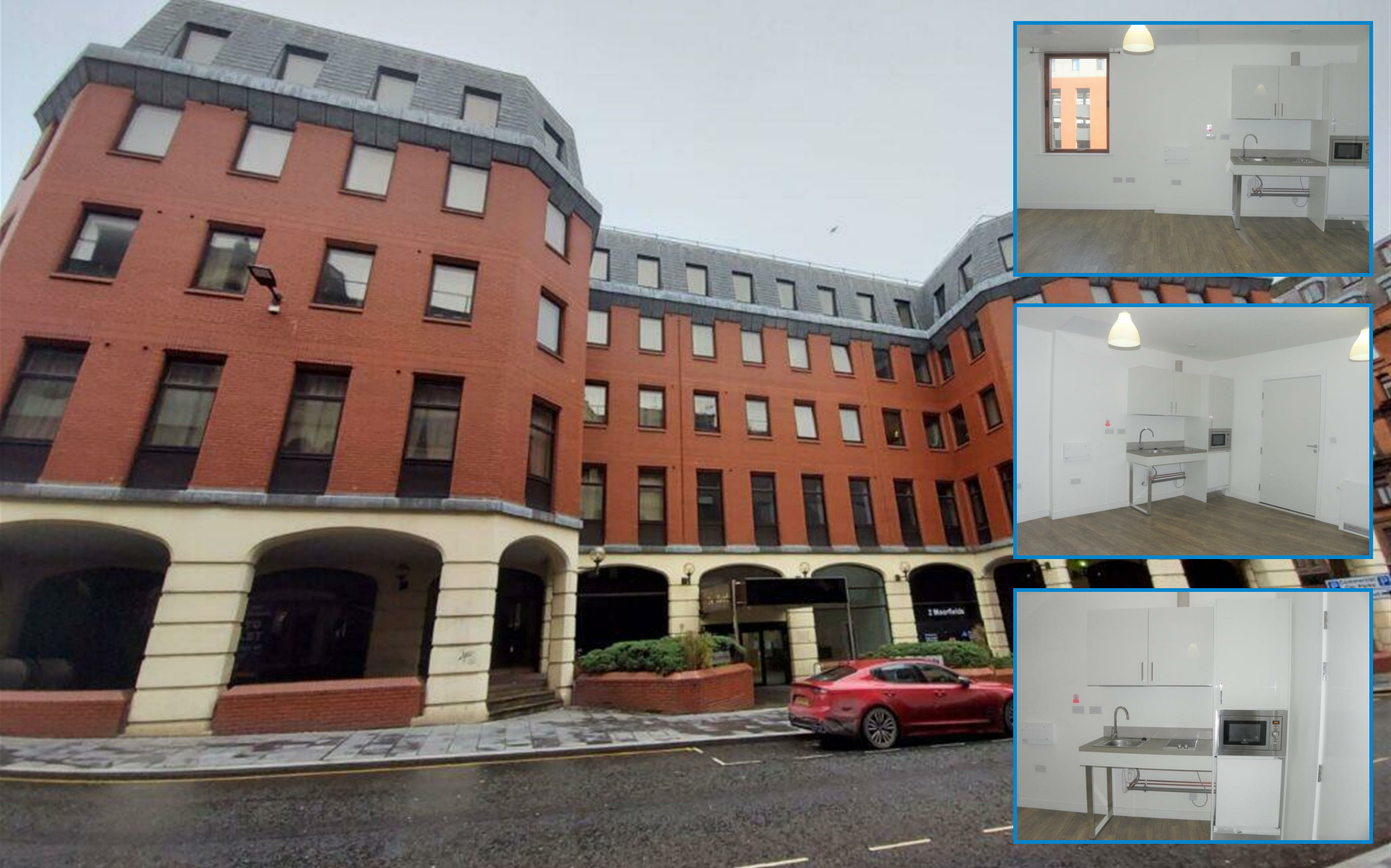
Studio 402 2 Moorfields, Liverpool , L2 2BT £750 Per month