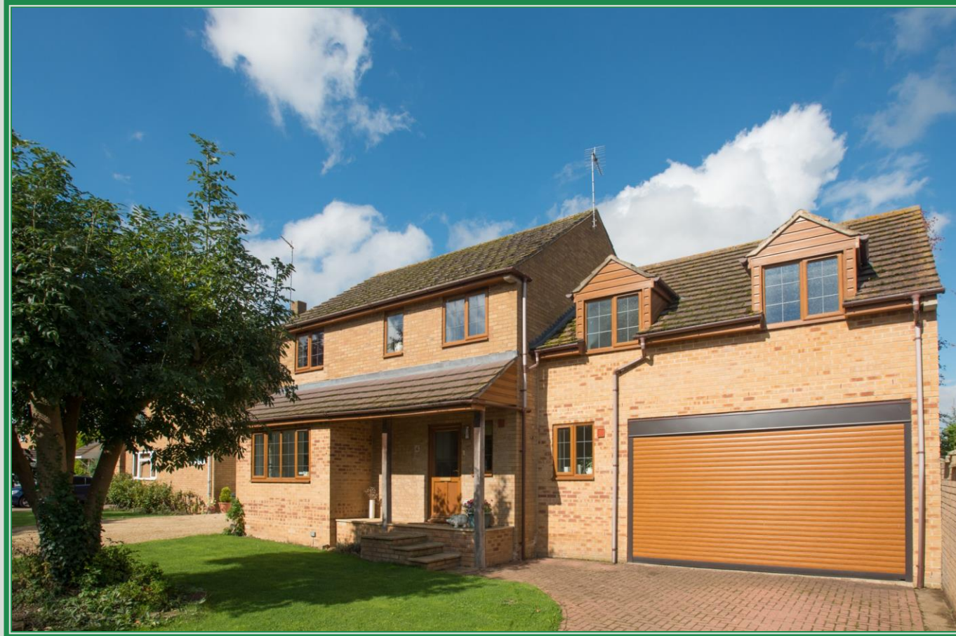
Barford St Michael Oxfordshire