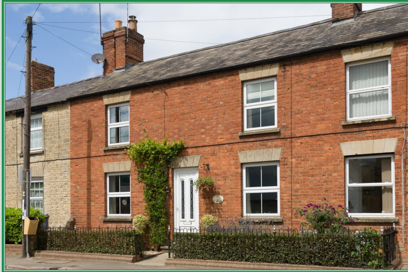
Middle Barton Oxfordshire