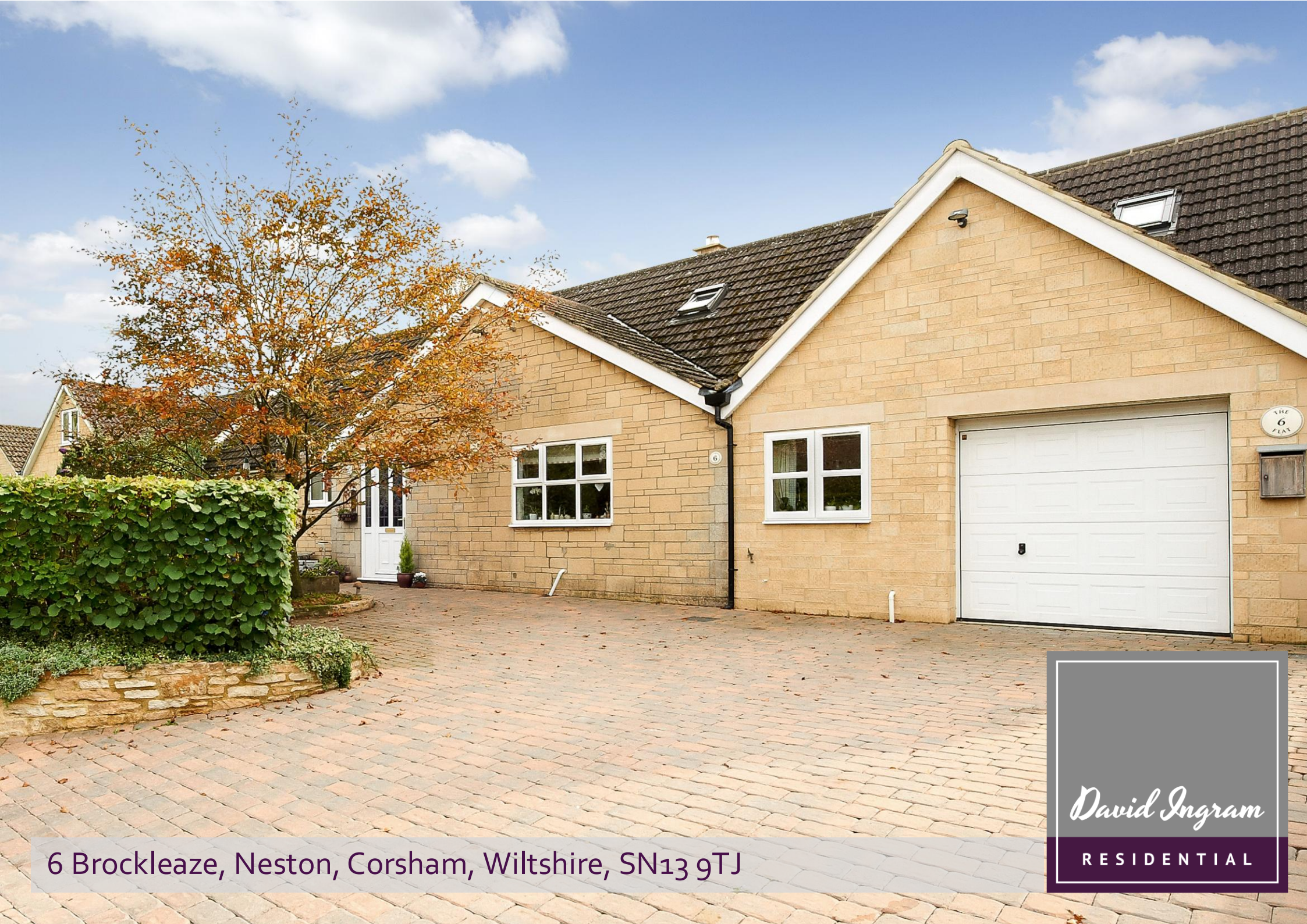
6 Brockleaze, Neston, Corsham, Wiltshire, SN13 9TJ