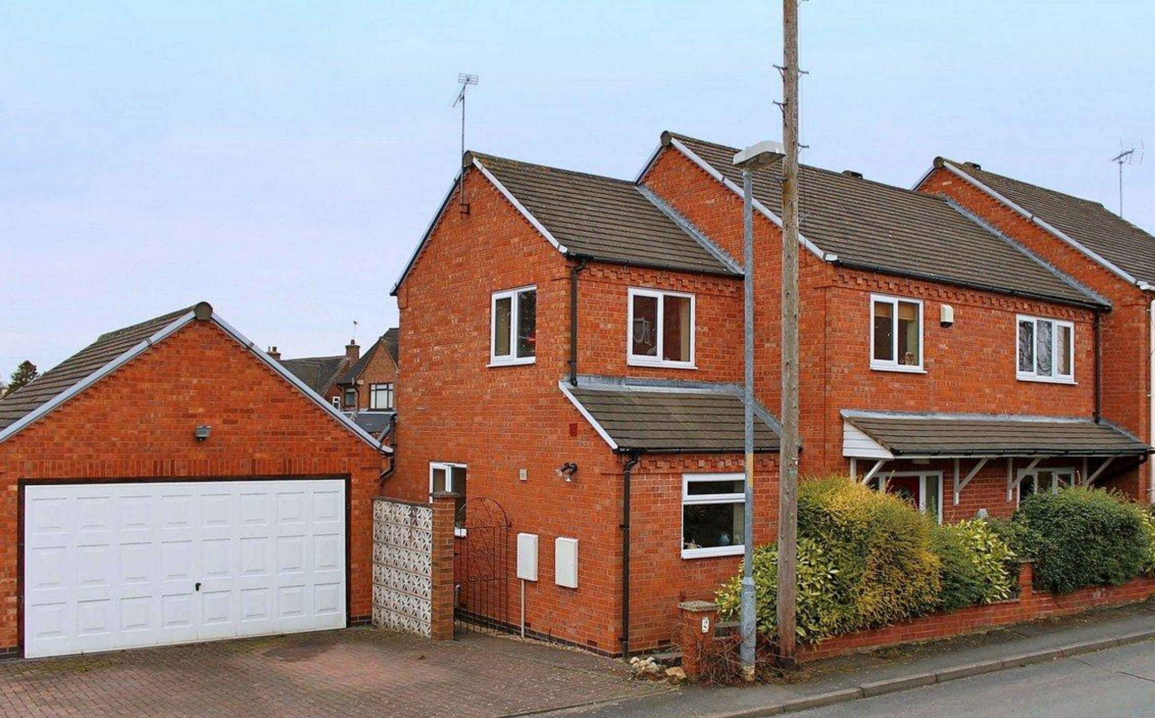
Manor House Lane, Astwood Bank, Redditch, B96 6EG | Offers Over £290,000 Four Bedroom Semi-Detached House