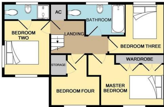
1ST FLOOR APPROX. FLOOR AREA 525 SQ.FT. (48.7 SQ.M.)

MANOR HOUSE LANE, ASTWOOD BANK TOTAL APPROX. FLOOR AREA 1397 SQ.FT. (129.8 SQ.M.) For general guidance only and not to scale. Room contents shown are for illustrative purposes only. Made with Metropix ©2013