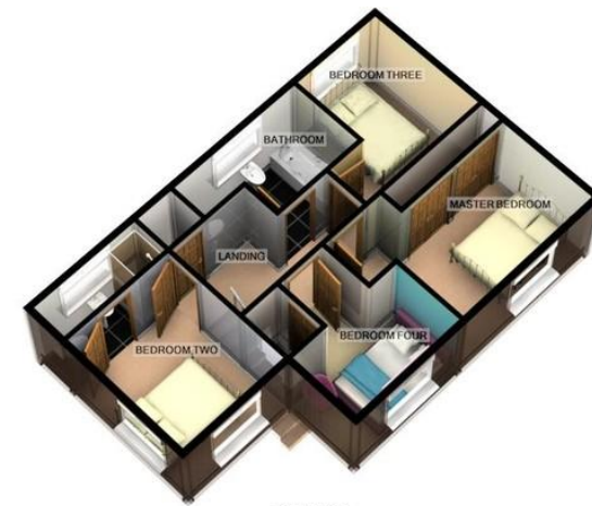
1ST FLOOR APPROX. FLOOR AREA 525 SQ.FT. (48.7 SQ.M.)

MANOR HOUSE LANE, ASTWOOD BANK TOTAL APPROX. FLOOR AREA 1397 SQ.FT. (129.8 SQ.M.) For general guidance only and not to scale. Room contents shown are for illustrative purposes only. Made with Metropix ©2013