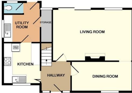
GROUND FLOOR APPROX. FLOOR AREA 873 SQ.FT. (81.1 SQ.M.)