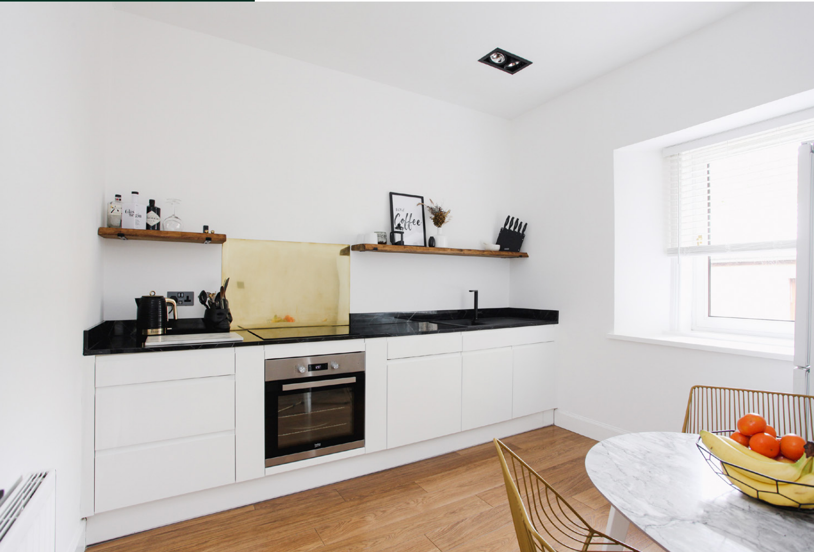
WONDERFUL TWO BEDROOM VICTORIAN APARTMENT