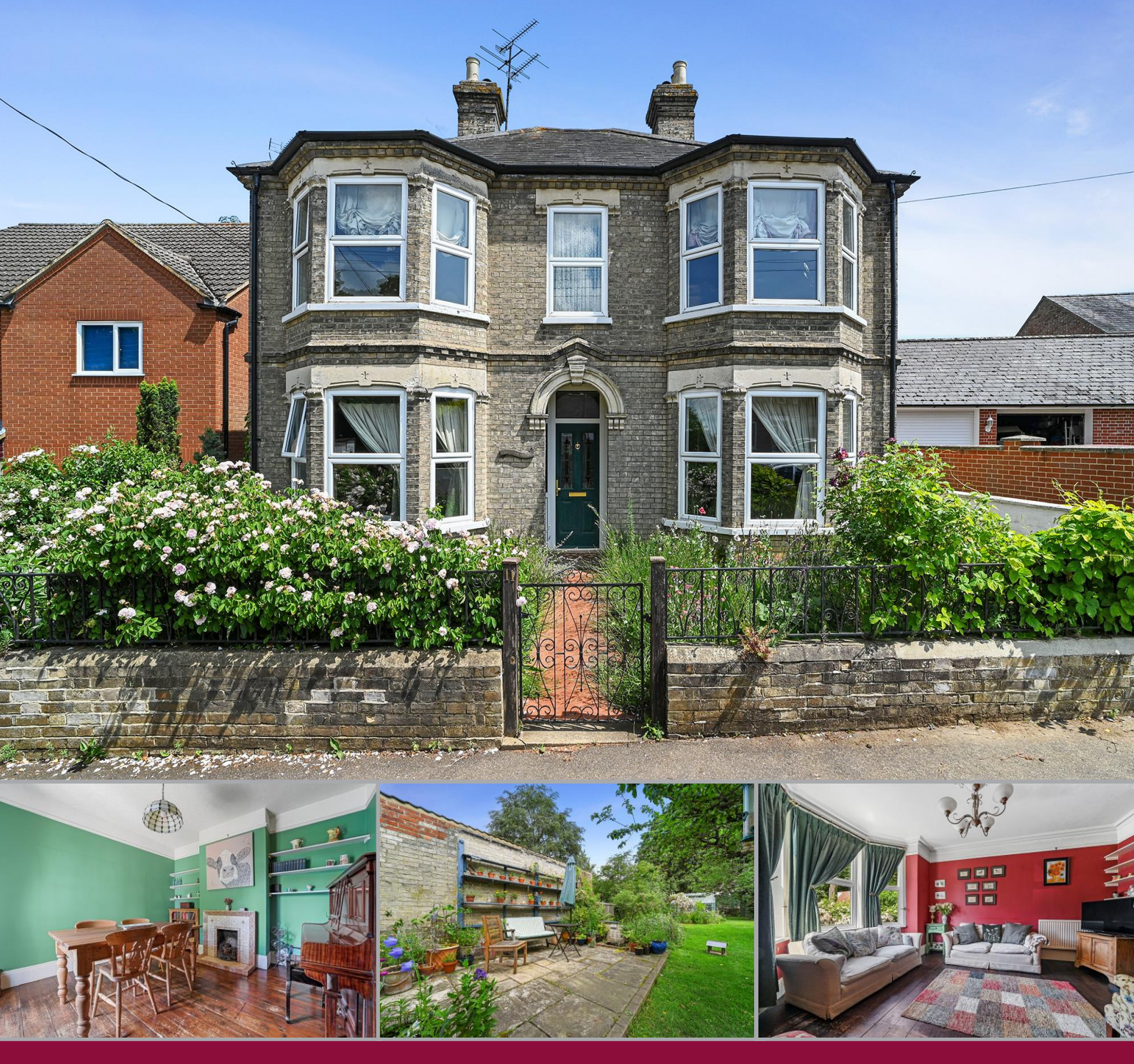
Waltham House | 11 Unity Road | Stowmarket | IP14 1AS

Specialist marketing for | Barns | Cottages | Period Properties | Executive Homes | Town Houses | Village Homes