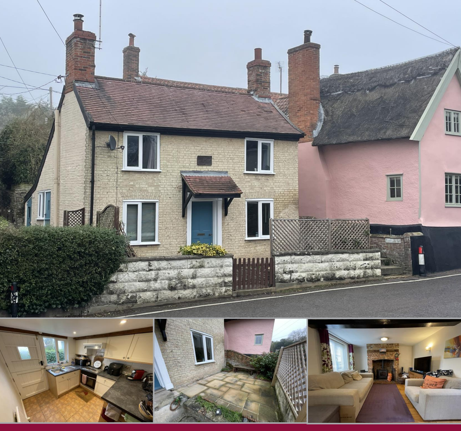
Moss Cottage | High Street | Coddenham | IP6 9PN

Specialist marketing for | Barns | Cottages | Period Properties | Executive Homes | Town Houses | Village Homes