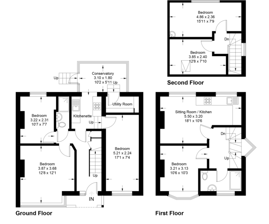
Illustration for identification purposes only, measurements are approximate, not to scale. Imageplansurveys @ 2024