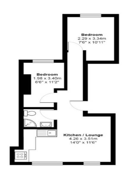
F2, 55 Stanley Road, Brighton

Total Area: 34.9 m² ... 376 ft² All measurements are approximate and for display purposes only