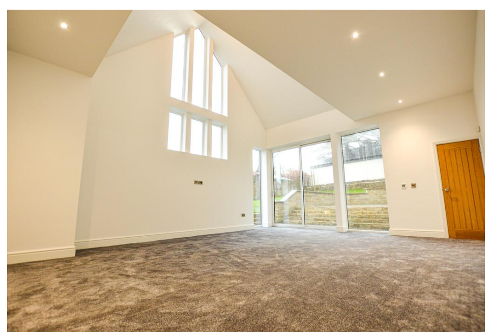
Butterly Lane New Mill, Holmfirth