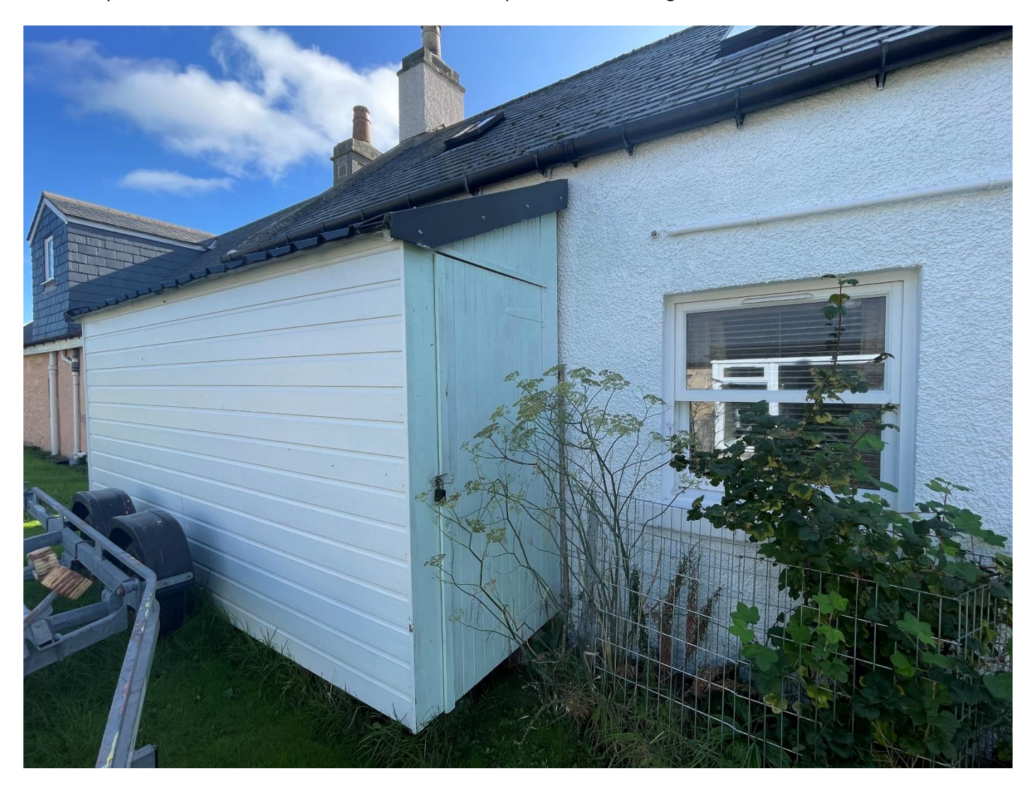
Council Tax Band Currently 'C'

Two newly built timber sheds with secure doors and box profile roof cladding.