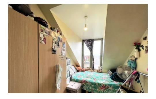
Ealing Road , Wembley, , HA0 4TH