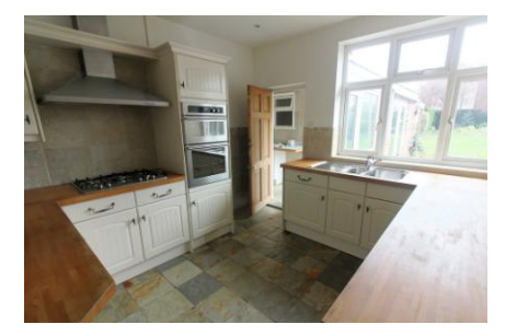
FOR SALE 2 Bed Detached Bungalow in Welford Road, Knighton, LE2 6EL