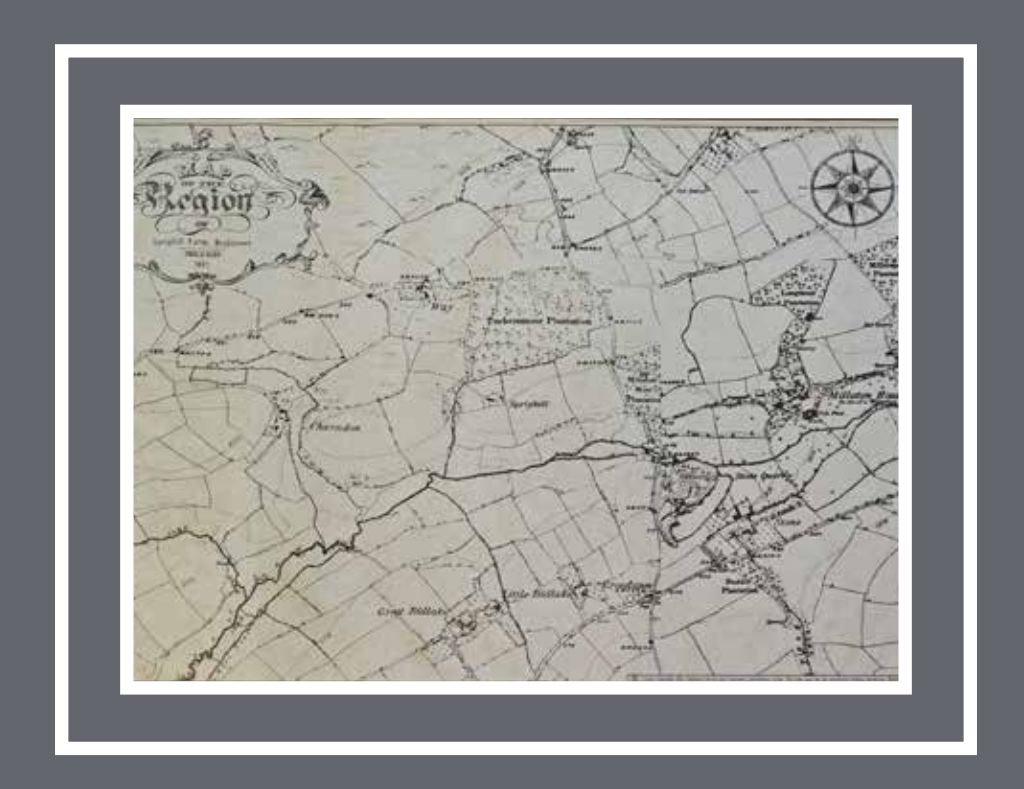
Sprighill Farm, Bridestowe, Okehampton, Devon. EX20 4QG What3Words: ///outbound.releasing.discussed