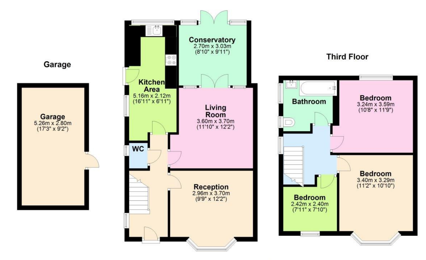
Total area: approx. 105.8 sq. metres (1139.1 sq. feet) 8 Springfield Drive, Chester