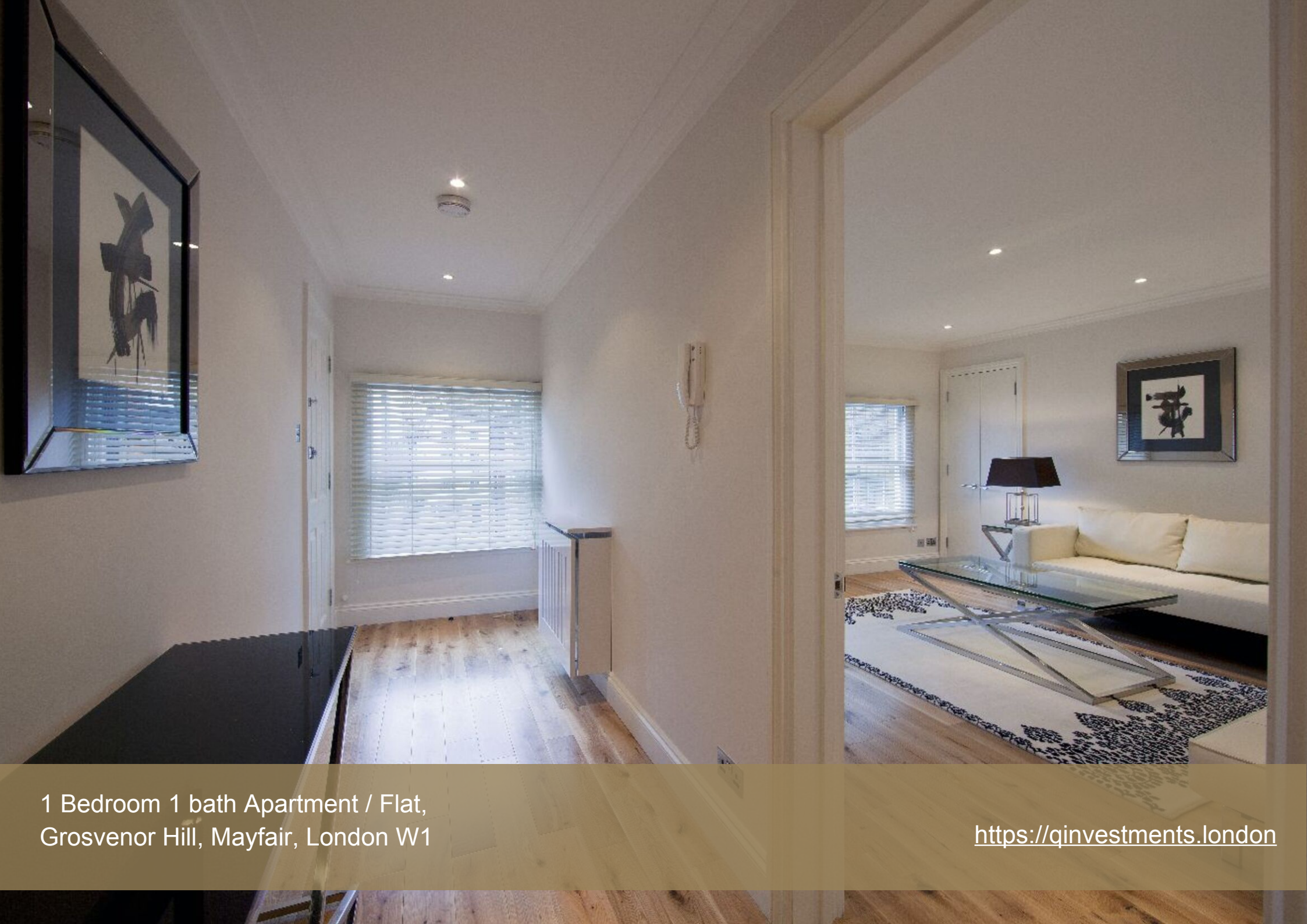
1 Bedroom 1 bath Apartment / Flat, Grosvenor Hill, Mayfair, London W1