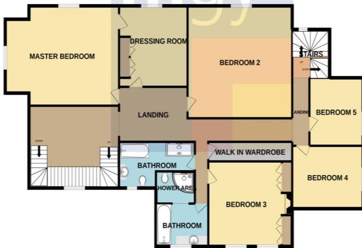
1ST FLOOR 2141 sq.ft. (198.9 sq.m.) approx.