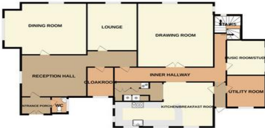
GROUND FLOOR 2214 sq.ft. (205.4 sq.m.) approx.