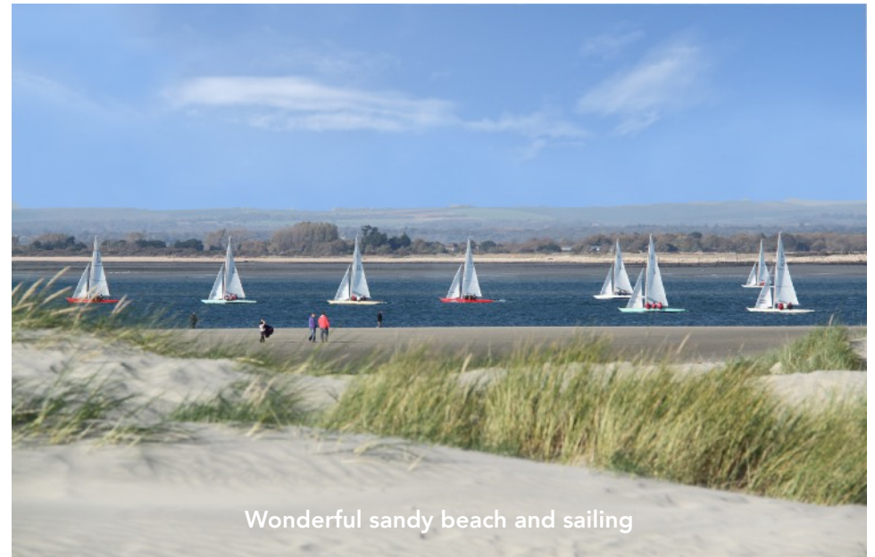
Wonderful sandy beach and sailing