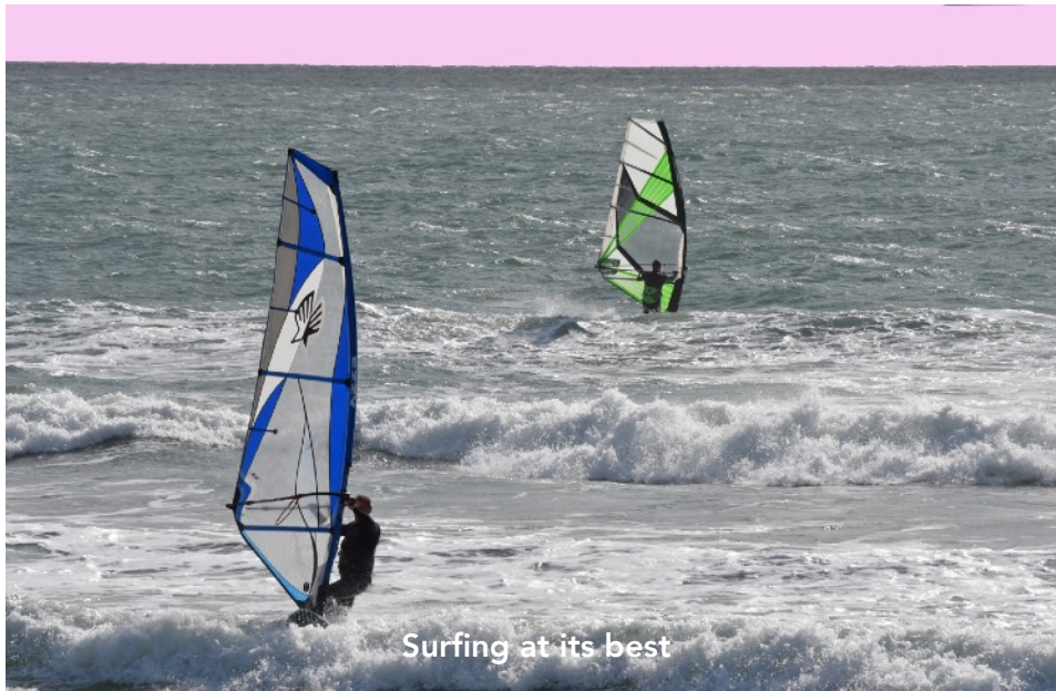
Surfing at its best

A stunning and beautifully appointed individually designed detached stylish house, built in 2021 to a high specification with spacious versatile accommodation, including 4 double bedrooms, 3 bathrooms (2 en-suite), superb kitchen/dining/family room, fabulous principle bedroom with vaulted ceiling and south facing balcony, located just a short walk to the beach.