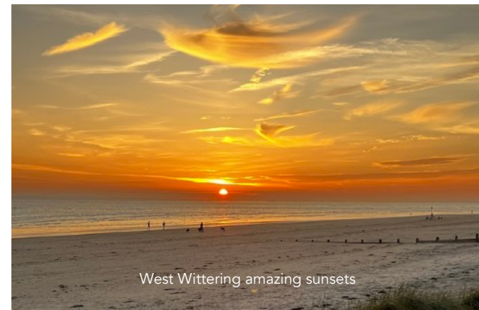
West Wittering amazing sunsets

LOCAL AUTHORITY: Chichester Council 01243 785166