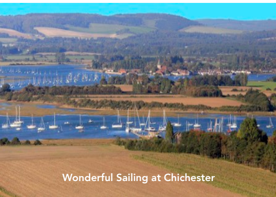
Wonderful Sailing at Chichester