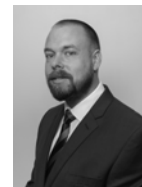
Professional photography GRANT LAWRENCE Photographer